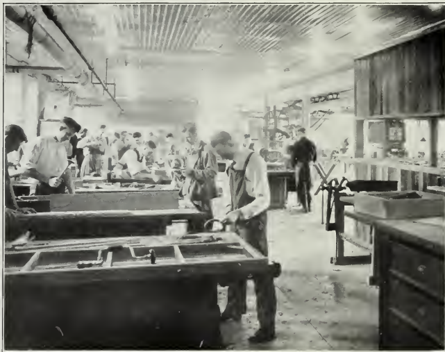
WOODWORKING SHOP OF THE INDUSTRIAL ARTS DEPARTMENT